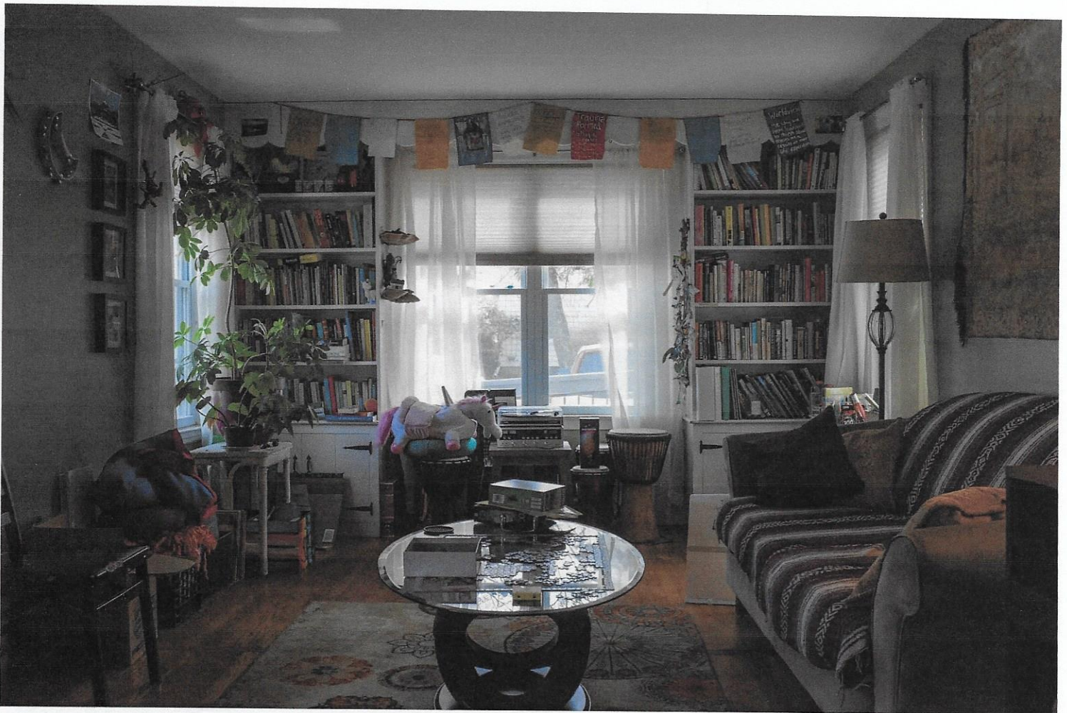
Afiya house in Western Massachusetts.